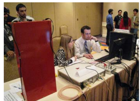
Students at the 2008 ASCE Active Vibration Control Design Competition