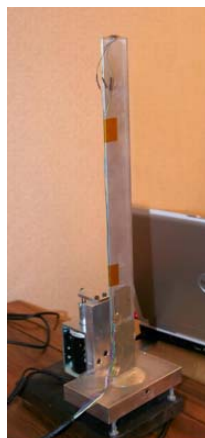
Adaptive Structures Shootout Test Rig with and without impedance change